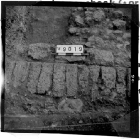
back (top) when closing locus:

ing s ng er elements nos: 1986-02-19 tos M7014.06, M7017.09 mission