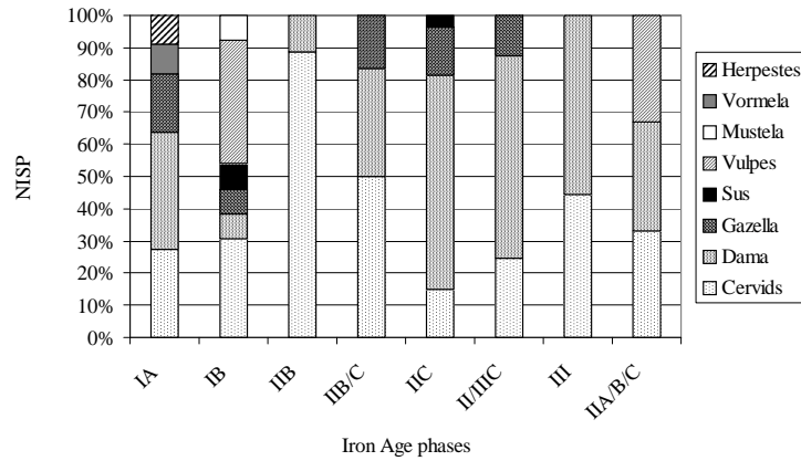
Fig. 4. NISP percentages of the wild mammals of Tell Deir'Alla.