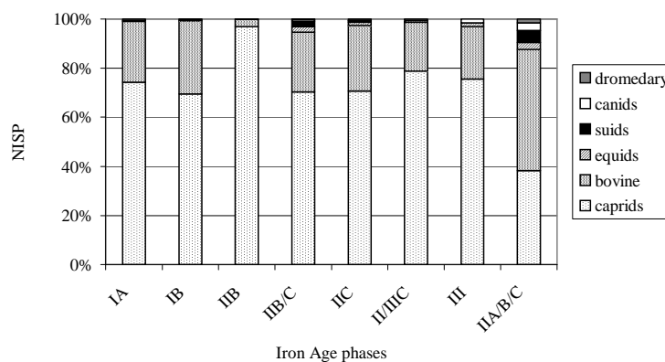
Fig. 2. Relative NISP percentages of the domestic mammals of Tell Deir' Alla.

If we look at domestic mammals as meat providers, it is not enough just to consider the number of bone fragments. Identical numbers of sheep/goat and cattle bones, will not represent the same amount of meat. The weight of the bone fragments stands in a linear correlation with the weight of the meat.