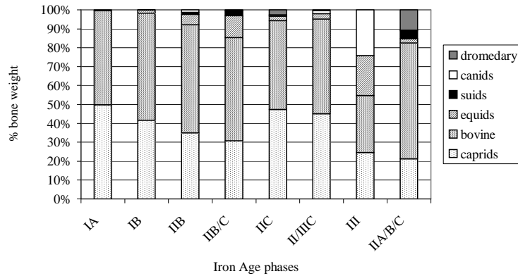
Fig. 3. Weight percentages of the domestic mammals of Tell Deir'Alla.

A different picture emerges if we look at Figure 3, where the bone weights of domestic mammals are given. It is not the sheep and goat which are the most important meat providers, but rather cattle with over 50% of the bone weight. Pigs do not seem to be important as meat providers. Equids and dromedary also display relatively low percentages in bone weight, but probably neither of these animals were ever, or even sporadically eaten, as only a few bones show cutmarks.