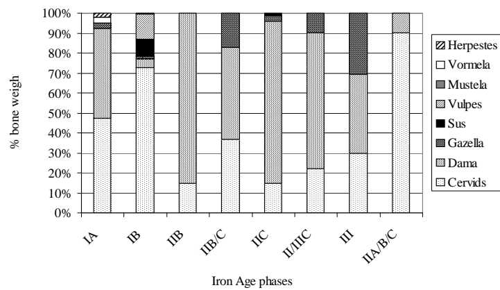
Fig. 5. Weight percentages of the wild mammals from Tell Deir'Alla.

mustelids or the Egyptian mongoose have cutmarks on them. This makes it doubtful that these animals were skinned.