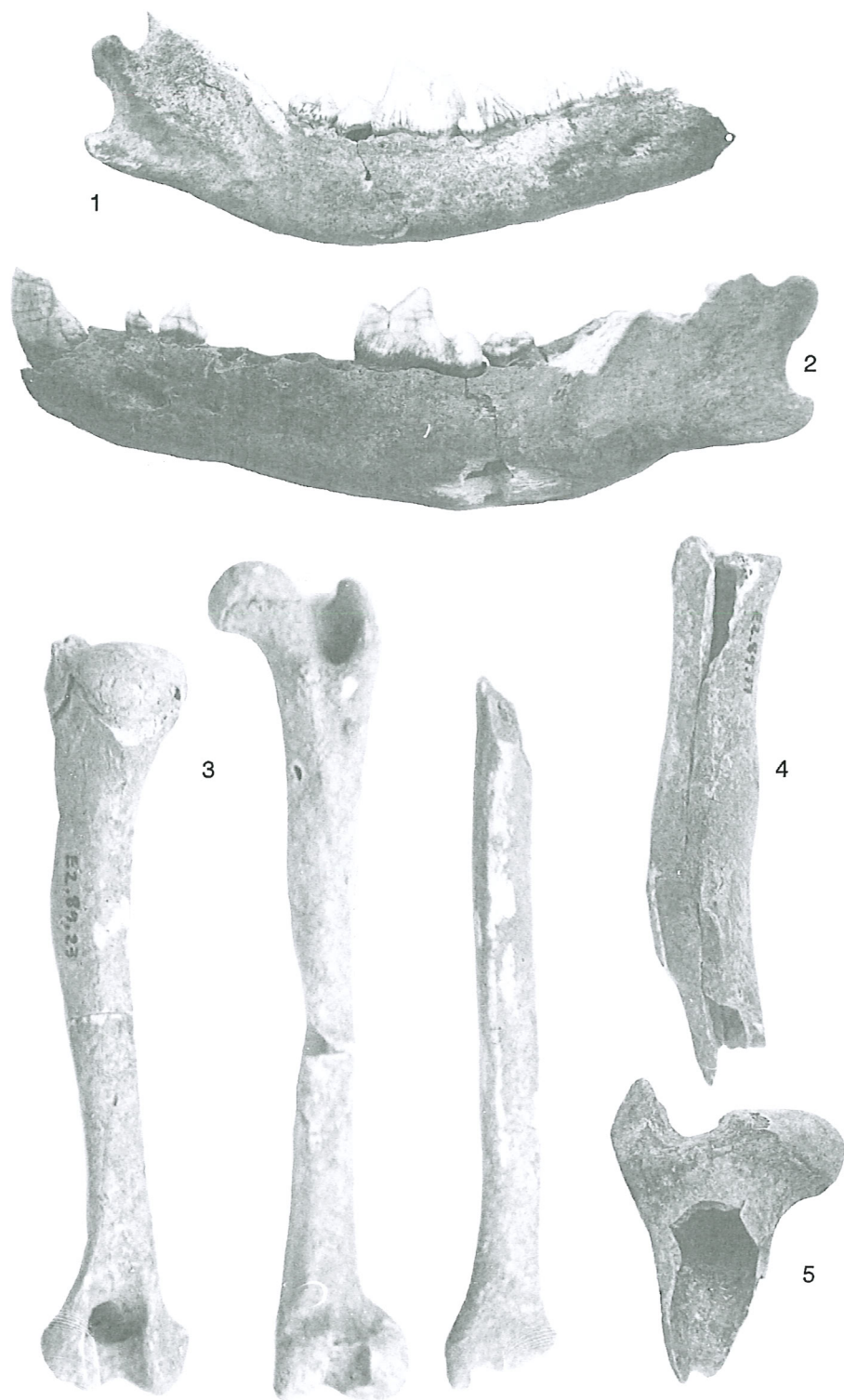
Fig. 2. 1= Canis familiaris , mandible, Iron Age I, life size, 2= Canis familiaris , mandible, Iron Age I, life size, 3= Canis familiaris , humerus, femur and tibia of the same individual, Iron Age III, life size, 4= Ovis vel Capra pathological metatarsus, Iron Age I, life size, 5= Gazella sp. femur, Iron Age III life size.